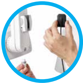
Integrated control box for easy accessibility

The Planmeca ProX intraoral x-ray system adapts to both short-cone and long-cone imaging techniques. Versatility is a Planmeca ProX standout feature with five different arm lengths: 60", 65", 70", 75", 80", and variable kV/mA to meet your imaging needs. Additionally, Planmeca ProX offers a smart control for maintaining consistency of radiographs whenever imaging conditions change, and a self-diagnostic control system that monitors all functions and displays error messages to assist in the correct use and service of the unit.