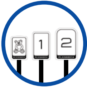
Pairs perfectly with Planmeca ProSensor® HD