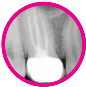
0.4mm Focal spot for exceptional image quality