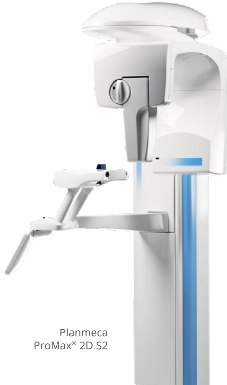
Planmeca ProMax ® 2D S2

Planmeca ProMax ® 2D S2 is an excellent choice for general practitioners who need 2D panoramic imaging but don't require all the advanced imaging options and features in other Planmeca 2D models. Priced competitively, this extraoral unit easily fits into budget minded practices.