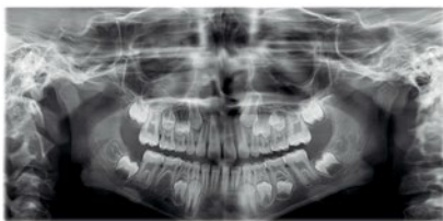
Child Mode Panoramic