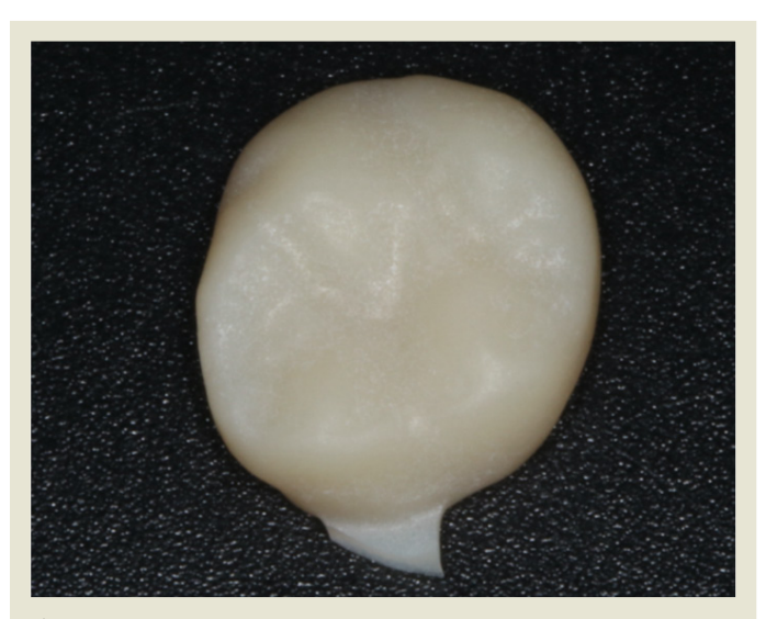
Figure 11—Milled CEREC Tessera crown using Primemill