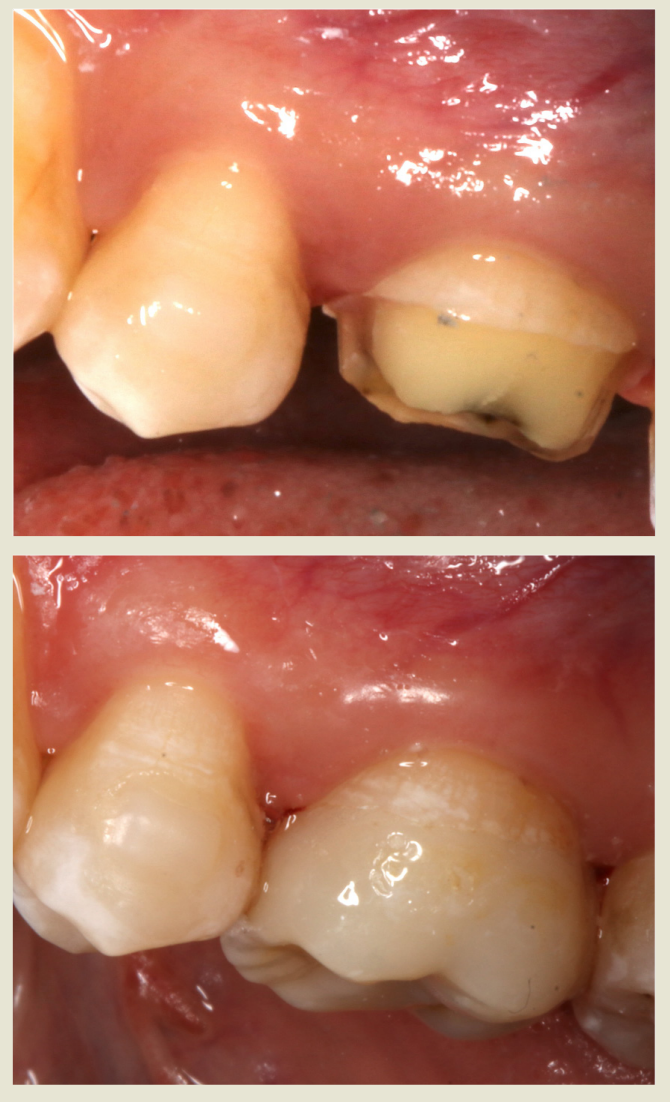
Figure 16—Pre- and postop buccal view showing translucency and blending of crown

No restoration adjustments were necessary, and total treatment time was 60 minutes (Figures 15 and 16).