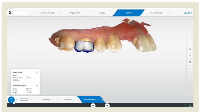
Figure 8—Primescan buccal view of crown design