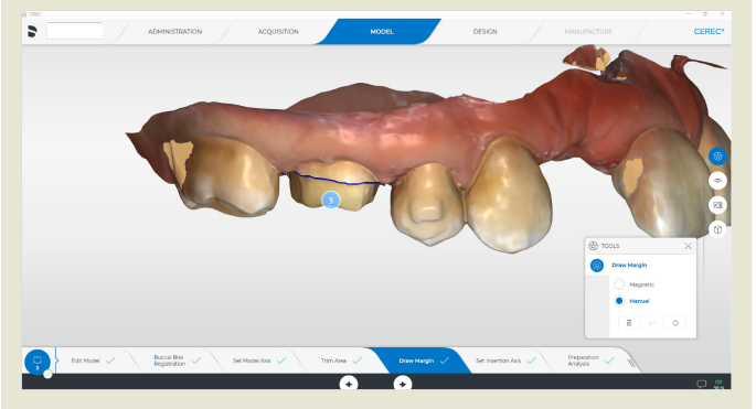
Figure 6—Primescan image from buccal of tooth No. 3