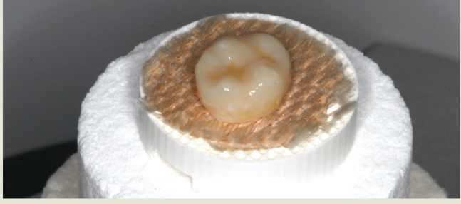
Figure 12—CEREC Tessera crown with stain and glaze applied in CEREC SpeedFire oven