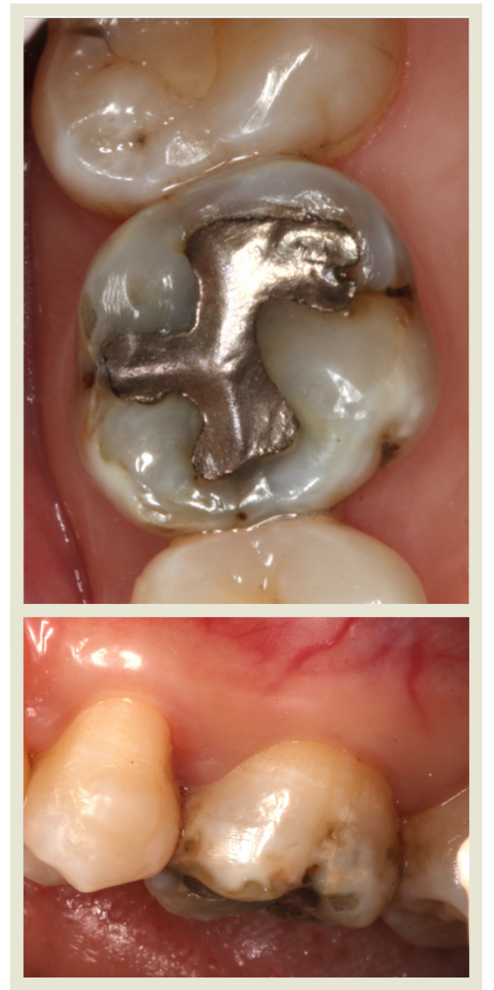
Figure 2—Occlusal and buccal views of tooth No. 3