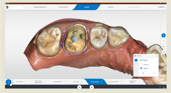
Figure 5—Primescan image and margination of tooth No. 3