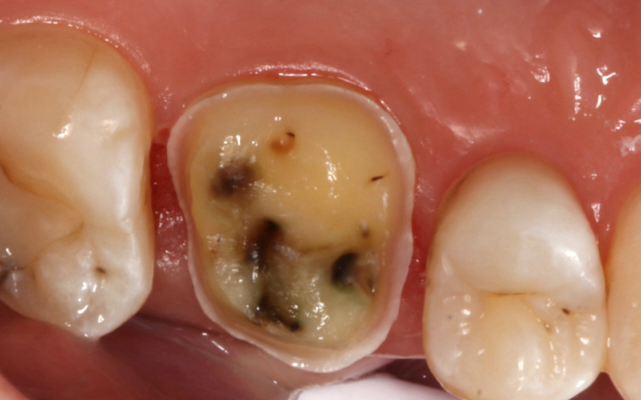
Figure 3—Crown preparation of tooth No. 3