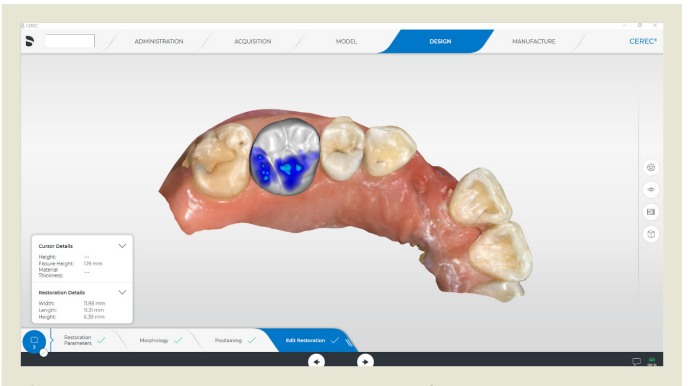
Figure 7—Primescan crown design in CEREC Software 5.1.3